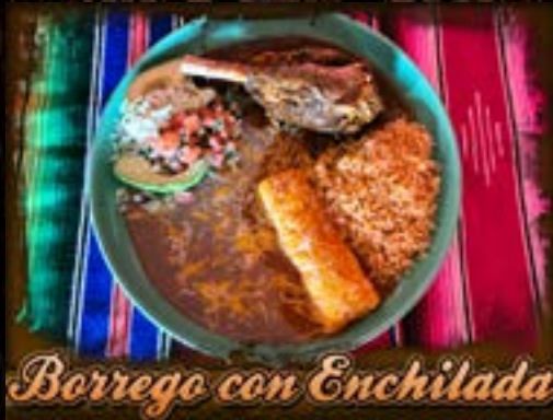
Borrego con Enchilada