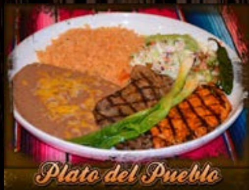
Plato del Pueblo