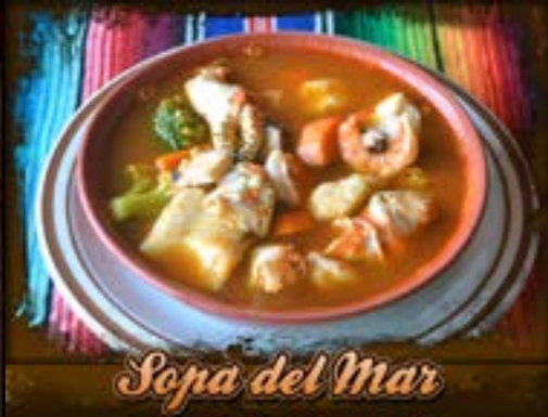
Sopa del Mar