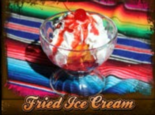
Fried Ice Cream