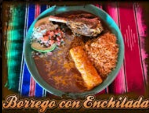
Borrego con Enchilada