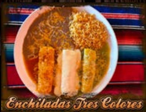
Enchiladas Tres Colores