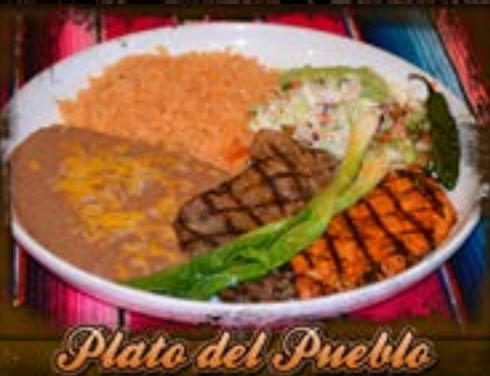
Plato del Pueblo