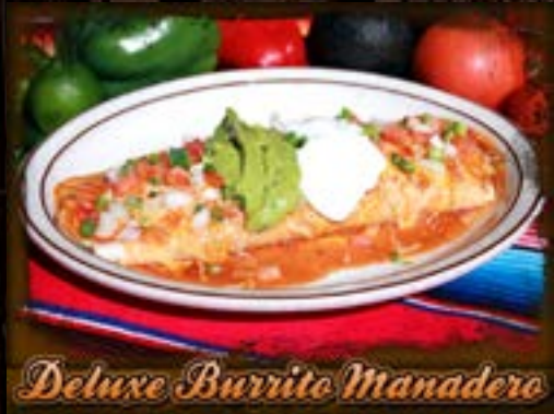
Deluxe Burrito Manadero

Chicken Breast or Top Sirloin Steak, sautéed with Green Peppers, Onions and Mushrooms in a tangy Salsa served with Rice and Beans wrapped in a Flour Tortilla covered with Salsa and melted Cheese, Guacamole and Sour Cream.