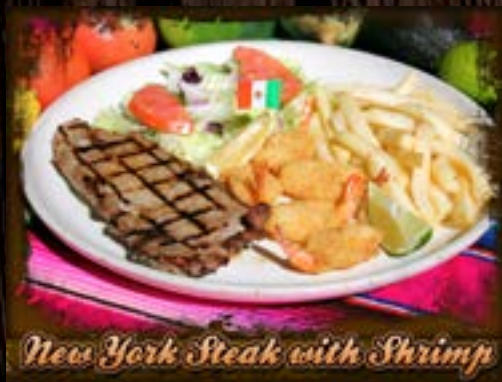
New York Steak with Shrimp