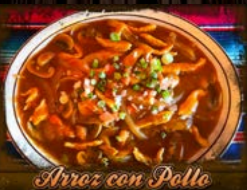
Arroz con Pollo