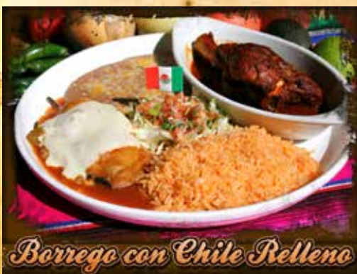
Borrego con Chile Relleno