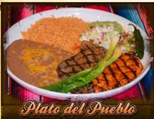
Plato del Pueblo