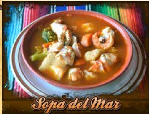
Sopa del Mar